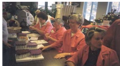
Auxiliary members working at community health fair

Members of the auxiliary man phones at the Hospital, shop for Nursing home residents, read for residents and assist the activity director of the Skilled Nursing Facility. Volunteers also aid in the Hospital's community and seniors health fairs.